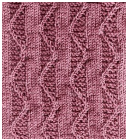
Zig-zag using twisted stitch technique

Cables, twisted-stitches, basket-weave, braid , lace and leafy are taught in this intermediate knitting class. You'll learn using squares, which you can later join together to make a beautiful patchwork afghan. Or you can enjoy as dishcloths or trivets. You'll learn many fabulous different stitches – enough so you can tackle anything!! Learn to read a chart, follow a complex pattern and keep working on fixing those mistakes that inevitably will happen. It's pretty amazing.