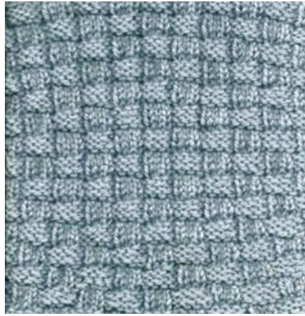
Knit & purl checkerboard variation

Cables, twisted-stitches, basket-weave, braid , lace and leafy are taught in this intermediate knitting class. You'll learn using squares, which you can later join together to make a beautiful patchwork afghan. Or you can enjoy as dishcloths or trivets. You'll learn many fabulous different stitches – enough so you can tackle anything!! Learn to read a chart, follow a complex pattern and keep working on fixing those mistakes that inevitably will happen. It's pretty amazing.