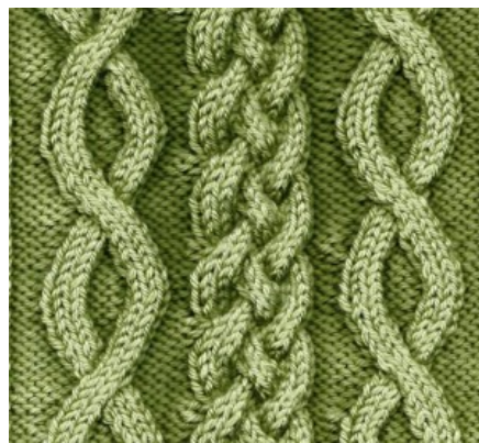
Braided & Crossover Cable

Improve your brain elasticity in this intermediate knitting class.