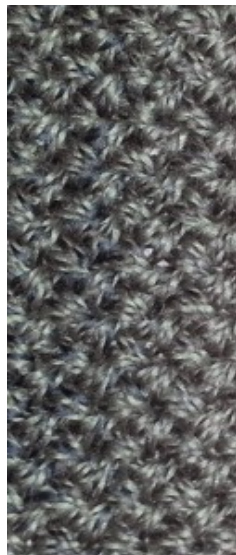
Basketweave knit stitch closeup

Row 2 (WS) Slip first two stitches (1 at a time) purl-wise wyif. *Skip next stitch on needle and purl into the stitch below while leaving both stitches on needle. P the skipped stitch and drop both stitches off needle.* Repeat between the * until 1 stitch from end of row. P last stitch.